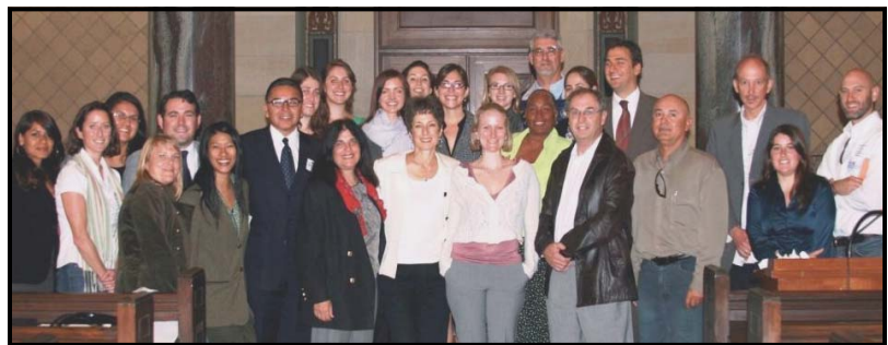
Community Scholars at City Hall, 2009

The research culminated in a briefing at Los Angeles City Hall on June 11, 2009 to present preliminary recommendations and solicit feedback from policymakers, city staff, community, labor, and environmental groups who helped shape