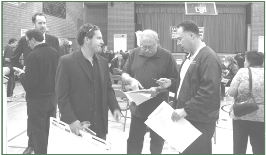
LA Labor Community Forum, 2009

Los Angeles has a unique opportunity to implement a Green Building Retrofit and Workforce Program that can serve as a model within the region and nationwide. The Program is innovative in its origin and fo-