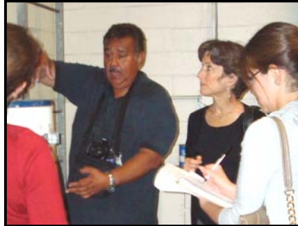
LA City Library Audit, 2009