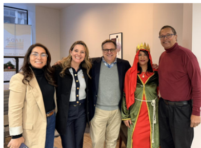
Celebrating Three Kings Day at LEAD

Wishing you a healthy, inspiring, and successful New Year!